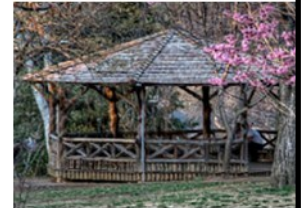
Gazebo in center of park