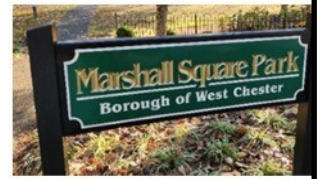
200 E. Marshall St. 19380

Mark your calendars and plan on attending. You don't need to bring anything, just yourselves and a sense of adventure for the scavenger hunt! We'll have use of the pavilion, the playground equipment, and restrooms.